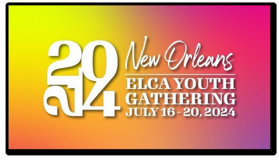
ATTENTION ALL CURRENT 7<sup>TH</sup> - 11<sup>TH</sup> GRADERS

Are you ready for an opportunity and experience of a lifetime? We sure hope so...and on July 16-20, 2024, we're inviting you to join us as we travel to New Orleans for the 2024 ELCA Youth Gathering. Over 30,000 + youth and their adult leaders will gather for a time of faith formation which will include time spent in an awesome interactive learning/fun center, worship and Bible study with amazing speakers and muscians, and service and fellowship events. These Youth Gatherings only occur every three years so we're hoping you'll be able to be a part of this awesome adventure!